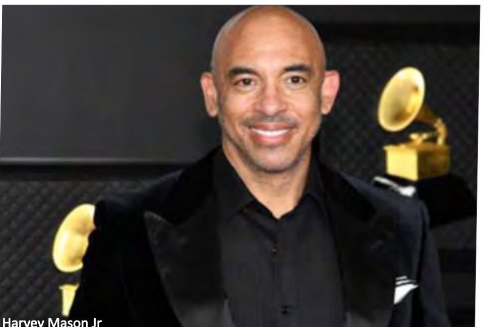
Harvey Mason Jr